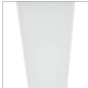
OP white acrylic diffuser