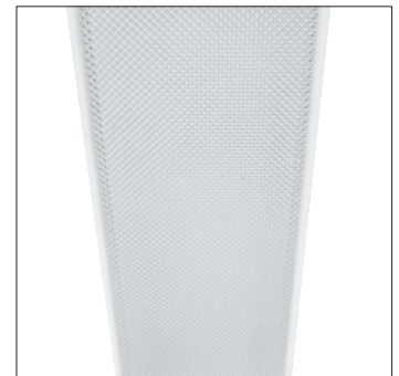
MP19H microprismatic diffuser